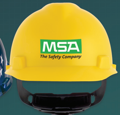
MSA Matte Finish 4 Point Fas-Trac® Cap (#102 Matte)