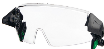
CLEAR HALF-FACE SPECTACLE, V-GARD H1 #10194820 Shaded #10217333 Price: $100.00 (T) Minimum Order: 3

No need for shield brackets, just snap in.