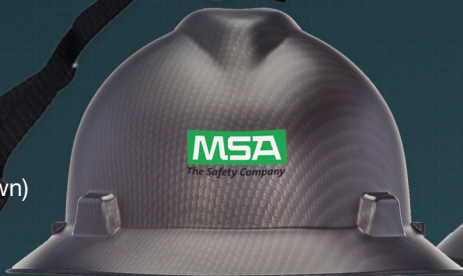
MSA Hydro Dip Cap & Full Brim (Sport Carbon Fiber Black Full Brim Shown)