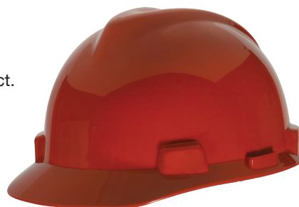
#142 Super V Blank Price: $50.00 (T) Minimum Order: 5

The Super V is MSA's V-Gard Hard Hat with Type 2 approval. Foam liner with integrated Fas-Trac® suspension. Lateral & Top Impact.