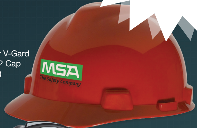
Super V-Gard Type 2 Cap (#118)