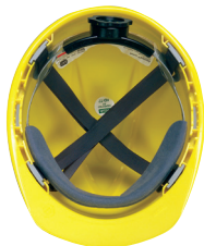
Fas-Trac® 4 Point Suspension System #102, 103, 104 107 & 108