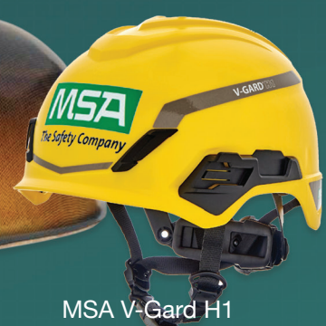
MSA V-Gard H1 Safety Helmet (#140)