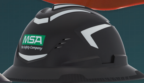
MSA V-Gard C1 Hard Hat (#114 Matte)