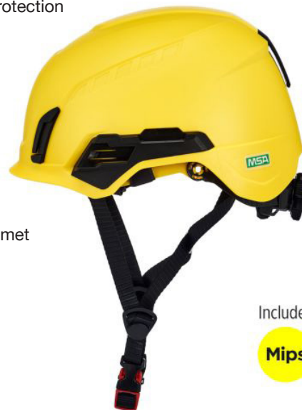
#151 H2 Type 2 Helmet with Mips Blank Price: $130.00 (T) Minimum Order: 3