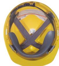
1-Touch 4 Point Suspension System #105, 106