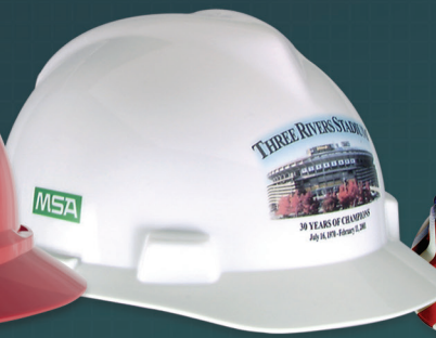
MSA V-Gard Cap (#101,102 & 105) shown with 4 color process logo