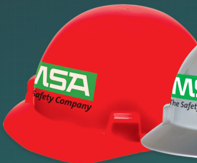
Smooth Dome Hard Hat (#108)