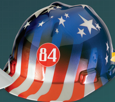
MSA Stars and Stripes (#118 with imprint)