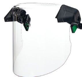
CLEAR FULL FACESHIELD, V-GARD H1 #10194818 Mesh/Forestry #10194819 Price: $120.00 (T) Minimum Order: 3