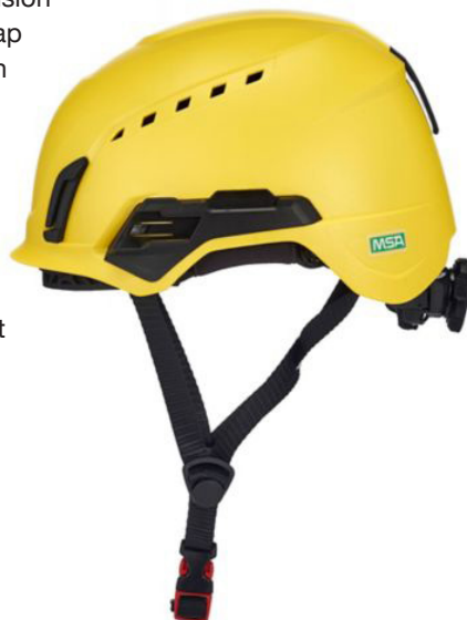
#150 H2 Type 2 Helmet without Mips Blank Price: $116.00 (T) Minimum Order: 3