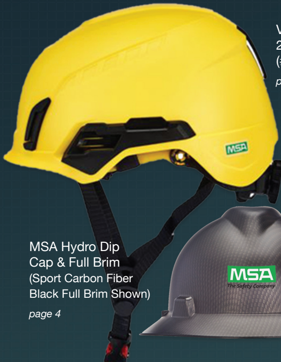
V-Gard H2 Type 2 Safety Helmet (#150)

$9.99 (T) PER HAT IN RED - BLUE - WHITE - BLACK IMPRINT