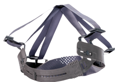
Staz-On® 4 Point Suspension System #101

We represent just MSA head protection. 65% of all hard hats are MSA #1 safety company! All hard hats are ANSI approved. All are Type 1 Top protection as outlined in ANSI 289.1. V Gard Caps + Full Brims meet Class E. Our H2 & Super V cap style is Type II protection (top, lateral and back).